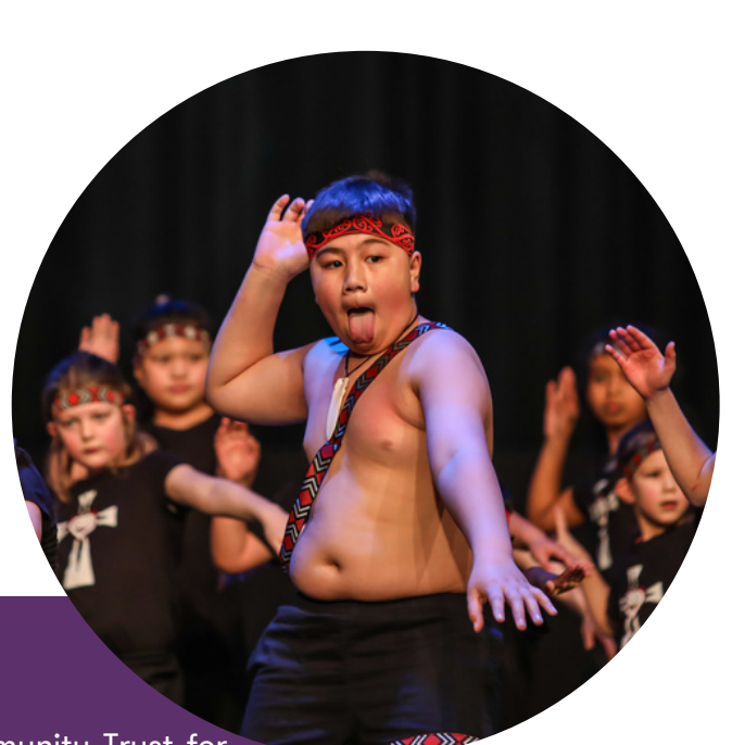
2023 Sacred Heart students at Polyfest